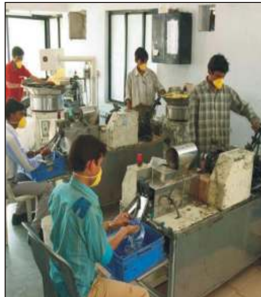
Inside view of Fancy Fitting's Unit

Fancy Fittings' pioneering designs, perfect product quality, customer friendly & enthusiastic approach, coupled competitive pricing make it a, attractive source for many products.